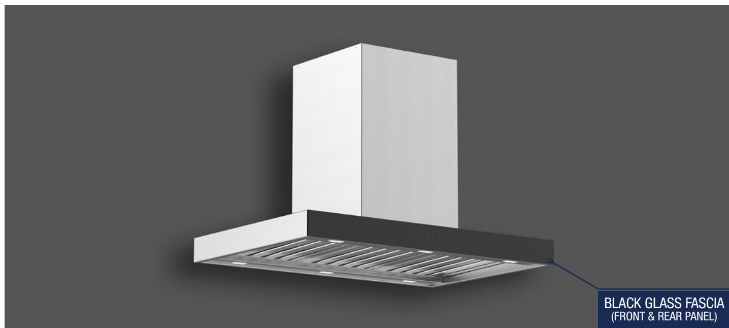
BLACK GLASS FASCIA (FRONT & REAR PANEL)